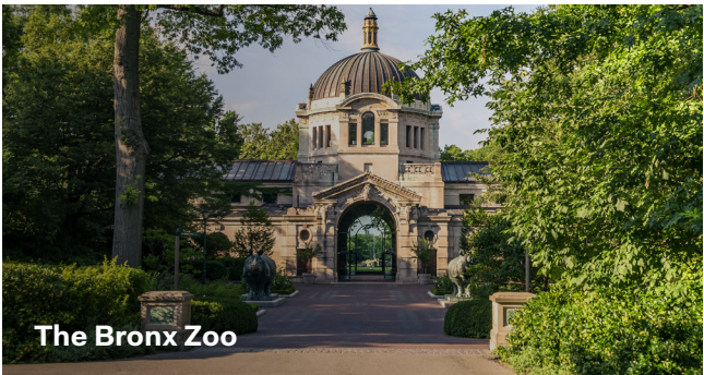
The Bronx Zoo