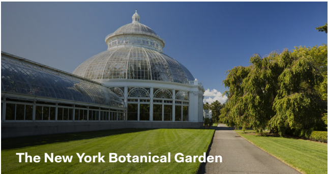
The New York Botanical Garden